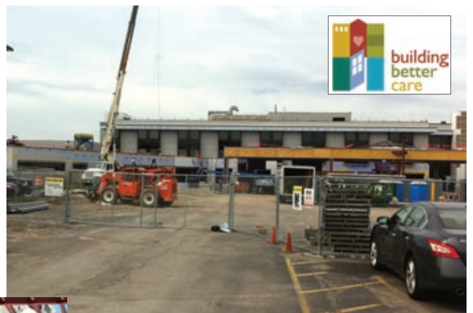
Construction of the Golisano Building will be completed in 2012.

Named in recognition of a $10 million gift from Paychex Founder B. Thomas Golisano, the new building will be home to the Golisano Restorative Neurology & Rehabilitation Center in 2014.